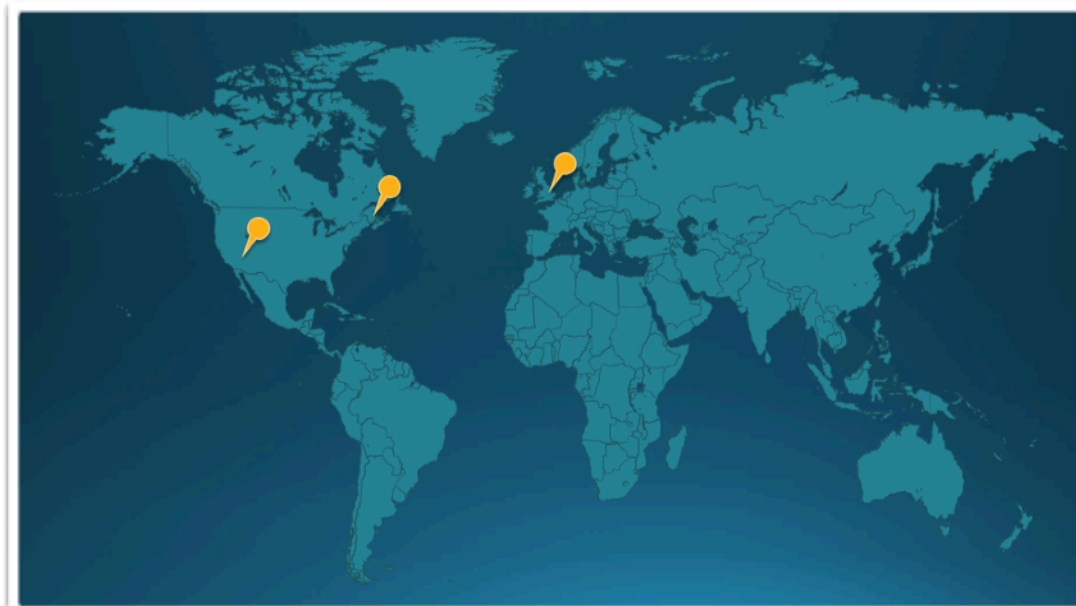
STU Psychology Research On Tour